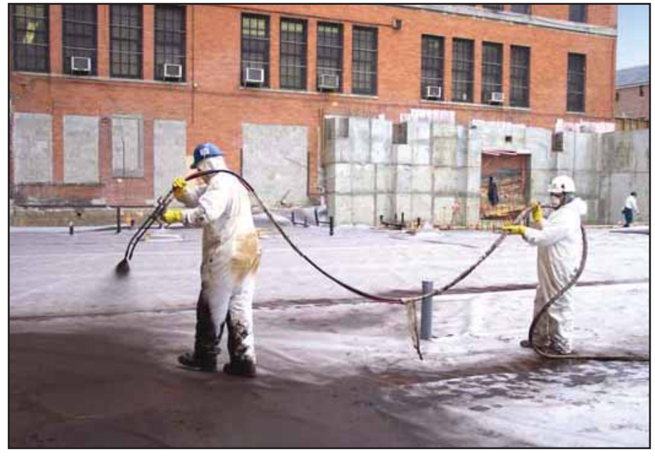
Figure 2. Installation of a fluid-applied vapor barrier at a public school in Queens, NY.

asphalt emulsion that is cold, sprayapplied. It is installed through the use of a two-part spray wand. The two parts mix right outside of the spray wand, and then, through a chemical reaction of the two parts, the product sets up as a solid, monolithic membrane (see Figure 2). The fluid spray is pliable and malleable, and